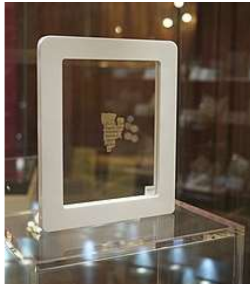
John Rylands Library in Manchester, England