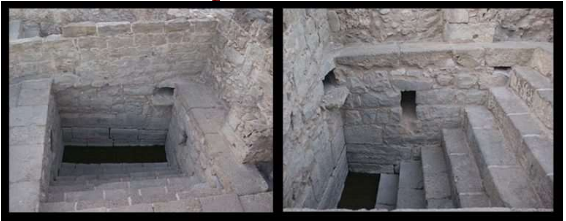
Mikva'ot, or ritual purification baths, at Magdala.