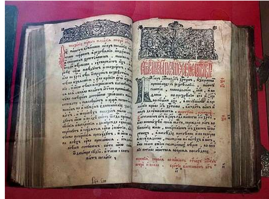
The Book of Acts – dated 1644